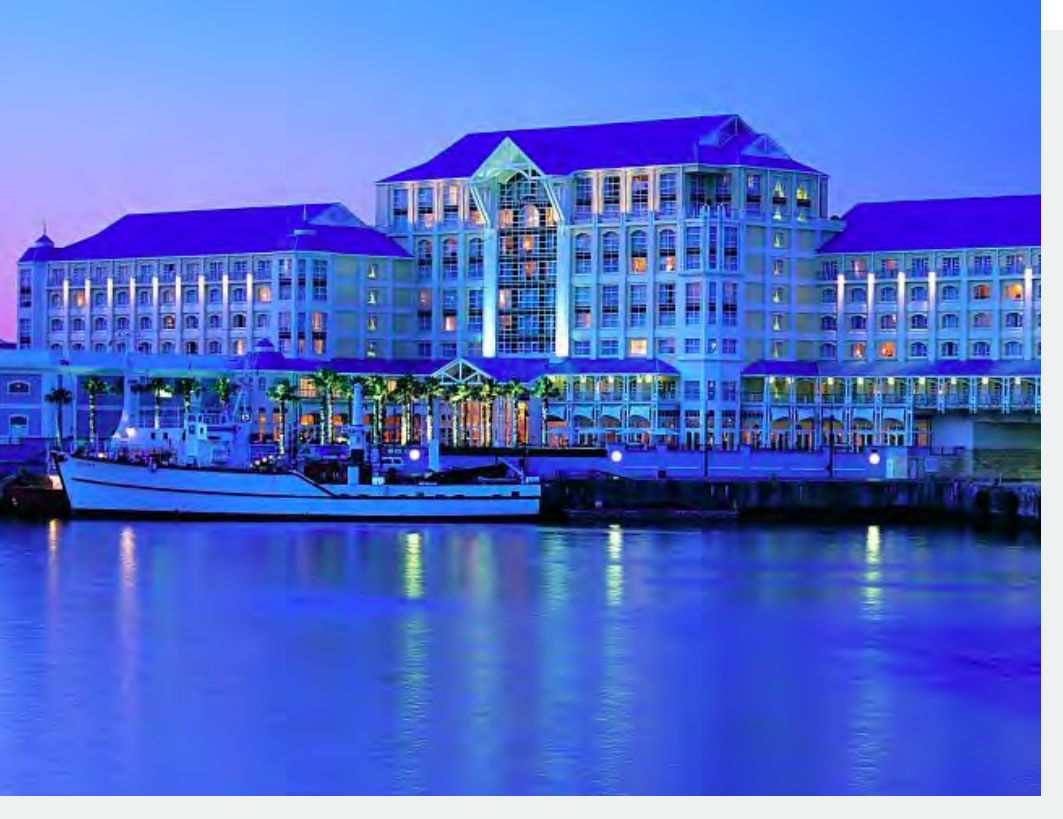
Table Bay Hotel

Considered to be the best address in Cape Town, this sophisticated 5 Star luxury hotel was opened by former South African president, Nelson Mandela. Right in the heart of Cape Town, you are steps from Victoria and Alfred Waterfront and 8 minutes by foot from V&A Waterfront. Enjoy locally inspired gourmet meals, Spa and Fitness facilities - making it a favorite destination for Couples.