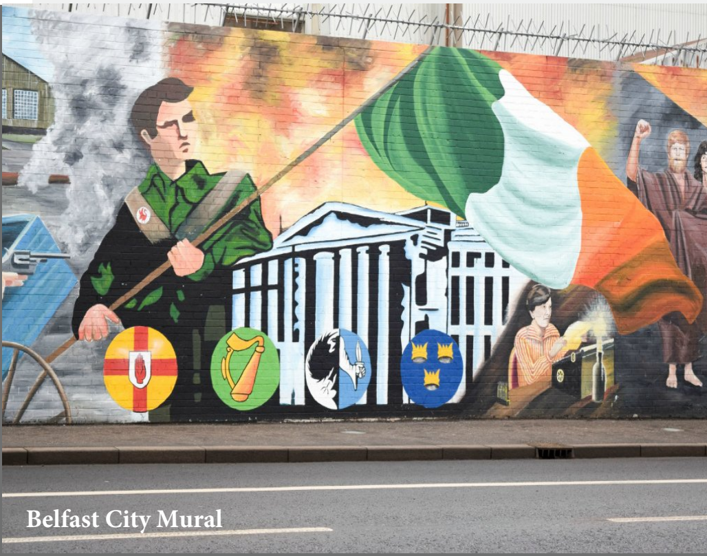
Belfast City Mural