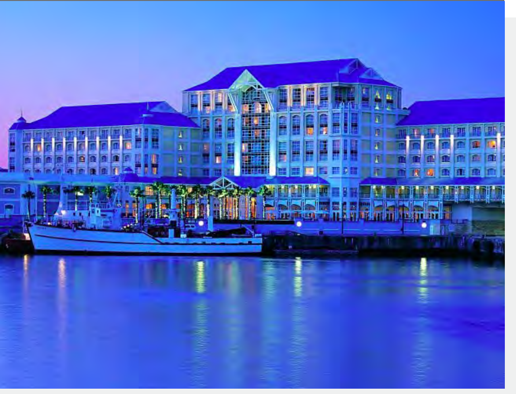
Table Bay Hotel

Considered to be the best address in Cape Town, this sophisticated 5 Star luxury hotel was opened by former South African president, Nelson Mandela. Right in the heart of Cape Town, you are steps from Victoria and Alfred Waterfront and 8 minutes by foot from V&A Waterfront. Enjoy locally inspired gourmet meals, Spa and Fitness facilities - making it a favorite destination for Couples.